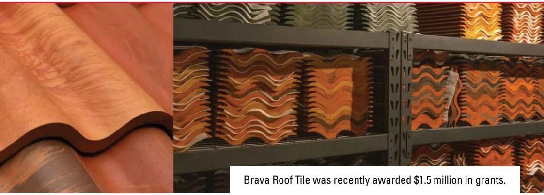
Brava Roof Tile was recently awarded $1.5 million in grants.